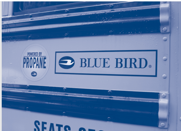
The District has replaced seven old diesel buses with new, greener propane models. This year's budget includes a proposition to purchase an additional five propane vehicles.

Carter adds that propane is a natural gas that is locally sourced here in America, and that petroleum is an imported oil. "Although propane buses get fewer miles to the gallon, the fuel's lower price also generates a savings," Carter says.